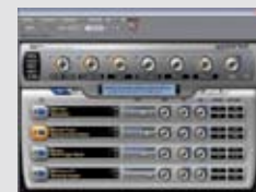
Xpand!™ Free Sample-Playback/Synthesis Workstation