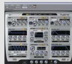
Hybrid™ High-Definition Synthesizer