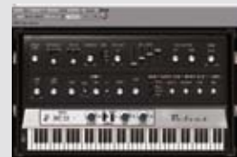
Velvet™ Vintage Electric Pianos