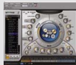
Strike™ The Ultimate Virtual Drummer

Check out these other A.I.R. instruments from Digidesign!