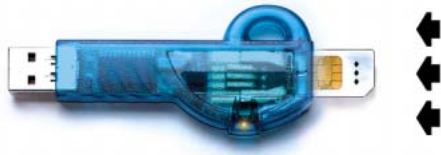
iLok with License Card GSM cutout inserted