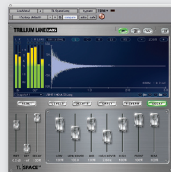
TL Space Native Edition convolution reverb

DV Toolkit 2 makes it easy to build a fully functional, cost-effective, and mobile post production solution on a Pro Tools LE system. With essential plug-ins, special Pro Tools capabilities designed for delivering sound for picture, plus support for 48 mono or 48 stereo high-resolution tracks, DV Toolkit 2 gives you the tools you need to get your work done.