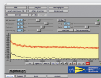
DINR LE noise reduction plug-in